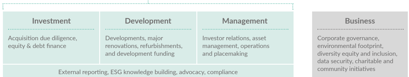
Responsible Investment Policy

This policy applies to all funds and client mandates that we manage with changes to implementation depending on the investment strategy at hand. Wherever the approach is different we provide details in this policy.