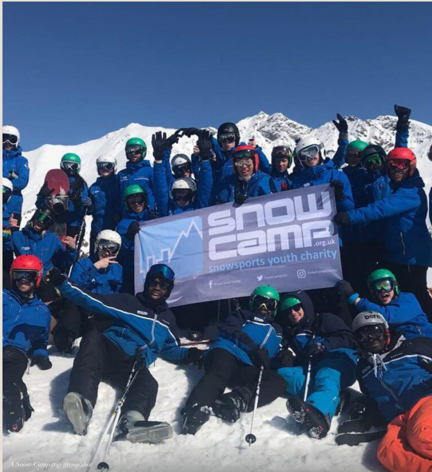
A Snow-Camp trip group shot