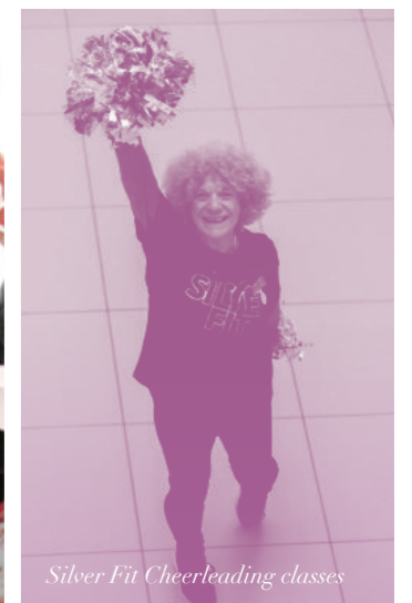
Silver Fit Cheerleading classes