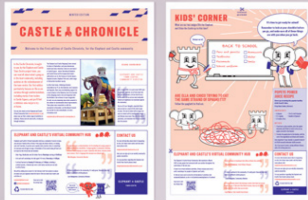
Local publication, Castle Chronicle

The Castle Chronicle is a local newspaper that launched in January 2021 and inside, the local community of Elephant and Castle can read all about what's going on in the area, including updates on the redevelopment of the town centre. Past editions include stories from traders in Castle Square, delicious new recipes to try at home and advertising space for local businesses. The Castle Chronicle is delivered to the full Elephant and Castle Opportunity Area of circa 15,000 homes on a quarterly basis.