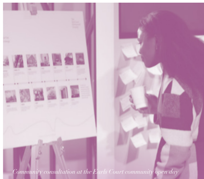
Community consultation at the Earls Court community open day