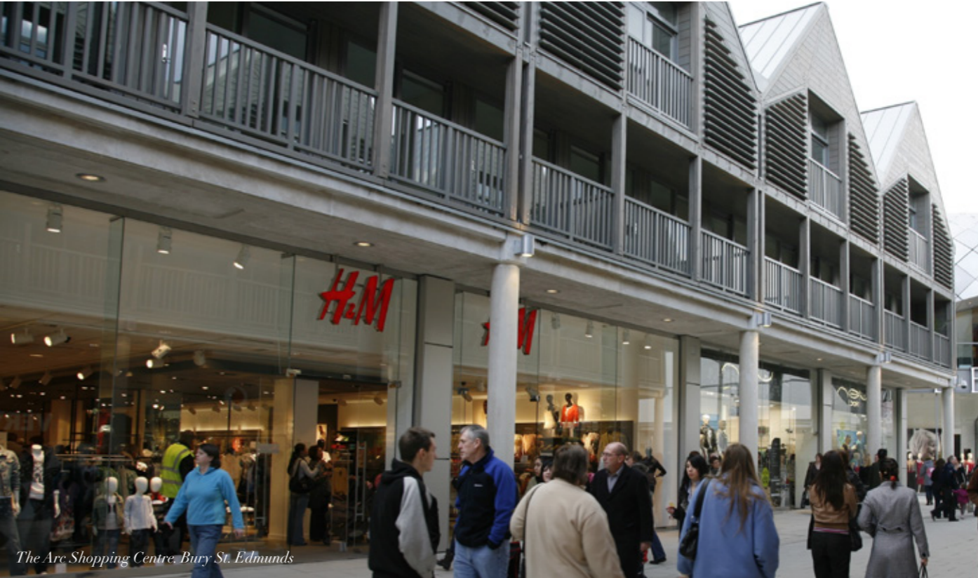
The Arc Shopping Centre, Bury St. Edmunds

"The award-winning finished development is already bearing fruit for the town, helping it thrive during the recent economic downturn. Car park usage across the town is significantly up, as is footfall. Independent retailers also tell us that trade is up; there's a burgeoning community now living above the new shops; and the new public venue – which was born out of the developer's consultation – is proving to be a great success."