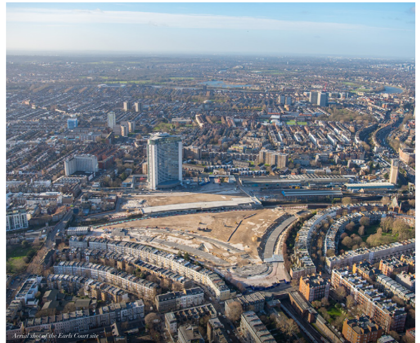
Aerial shot of the Earls Court site