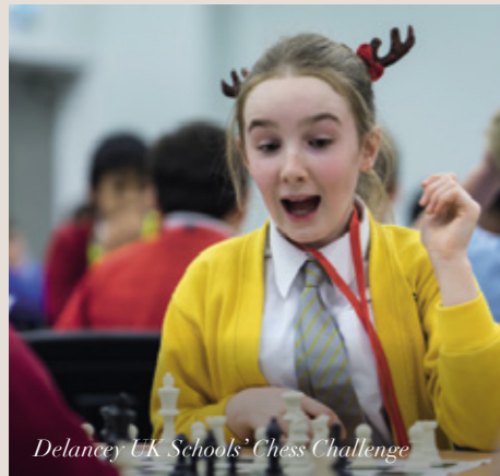
Delancey UK Schools Chess Challenge

Delancey and its platform businesses continuously seeks out ways to make much needed financial and in-kind contributions to the community and support several charities and deserving causes in the world of art, culture, education and health, as well as in more recent times providing vital support during COVID-19. These include amongst others: Dads House, a charity who provide support services and foodbanks for those who are struggling to put food on the table especially during the pandemic; East End Community Foundation, a charity dedicated to increasing opportunities for people living in the East End; The National Portrait Gallery's Schools and Hospitals Programmes across London; Snow-Camp youth charity; Young Minds; The Globe Theatre; and the UK's largest children's chess competition, the Delancey UK Schools Chess Challenge. For a wider list of who Delancey have supported to date you will find this at the back of this document.