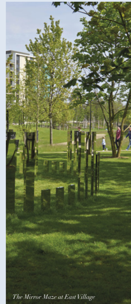
The Mirror Maze at East Village