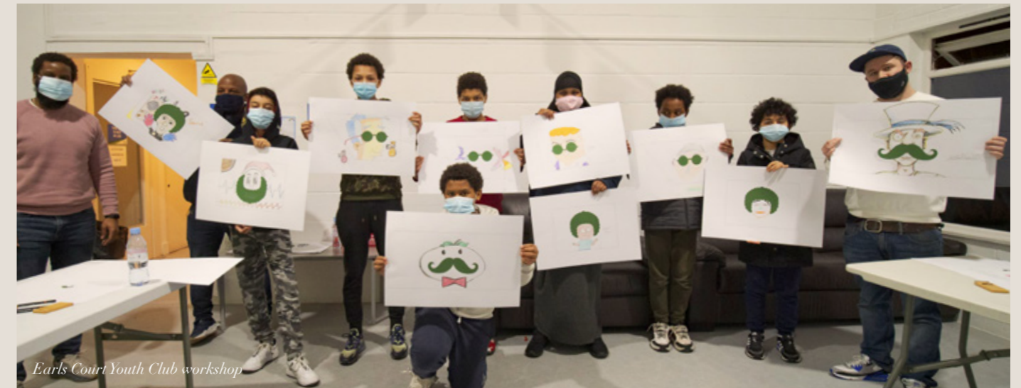
Earls Court Youth Club workshop