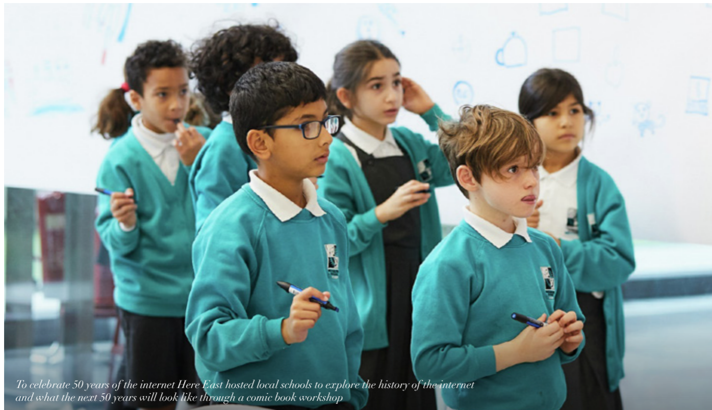
To celebrate 50 years of the internet Here East hosted local schools to explore the history of the internet and what the next 50 years will look like through a comic book workshop

In January 2021, Here East launched a new scholarship programme to support local young people in east London through higher education courses at the world-class universities based on campus - Staffordshire University London and LMA institution for media, music and performing arts. Open to secondary school pupils currently residing in Hackney, Newham, Tower Hamlets and Waltham Forest, the programme will deliver on-the-ground impact to the east London community and supporting the potential of young people in the area through the world-class institutions and business on the campus.