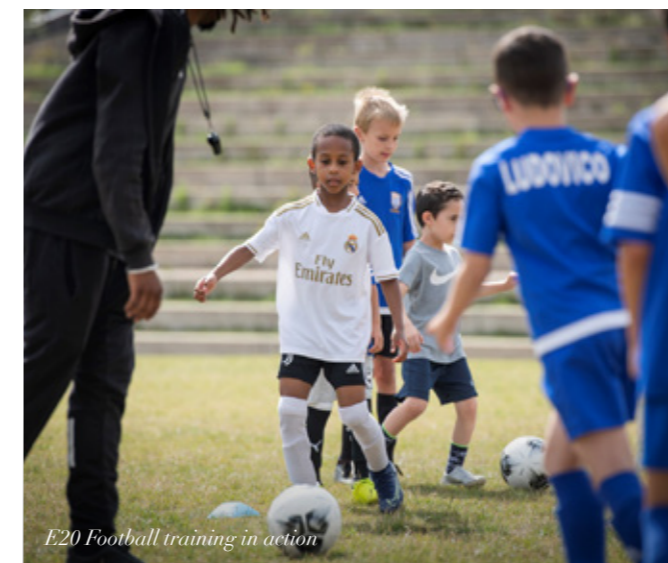
E20 Football training in action