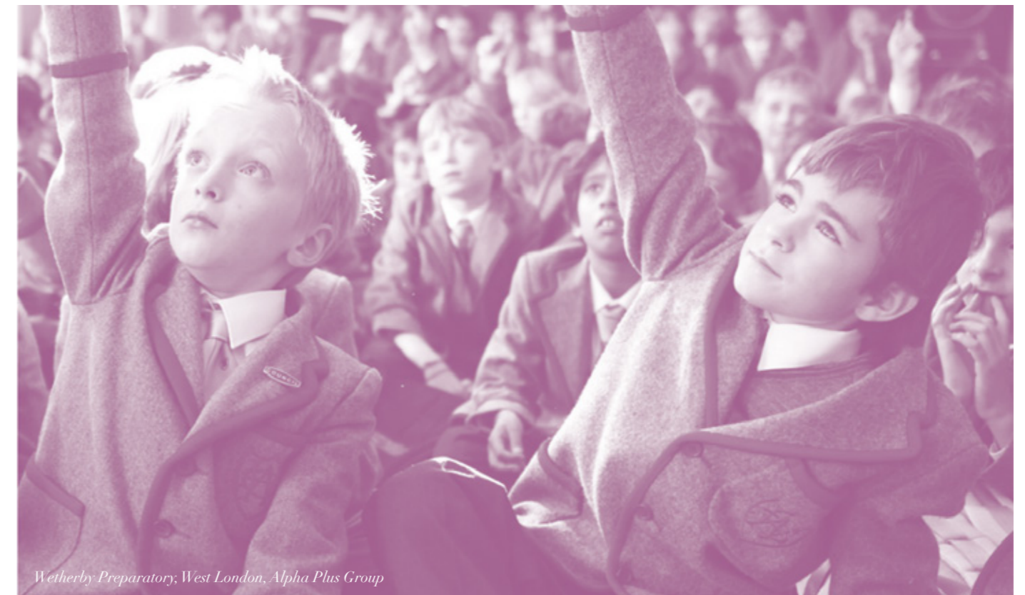
Wetherby Preparatory, West London, Alpha Plus Group

In April 2020, Alpha Plus Group also established a Hardship Fund to help families affected by the pandemic to pay Summer and Autumn term school fees. The Fund, which has now closed, made grants totalling over £1.5m to more than 300 families.