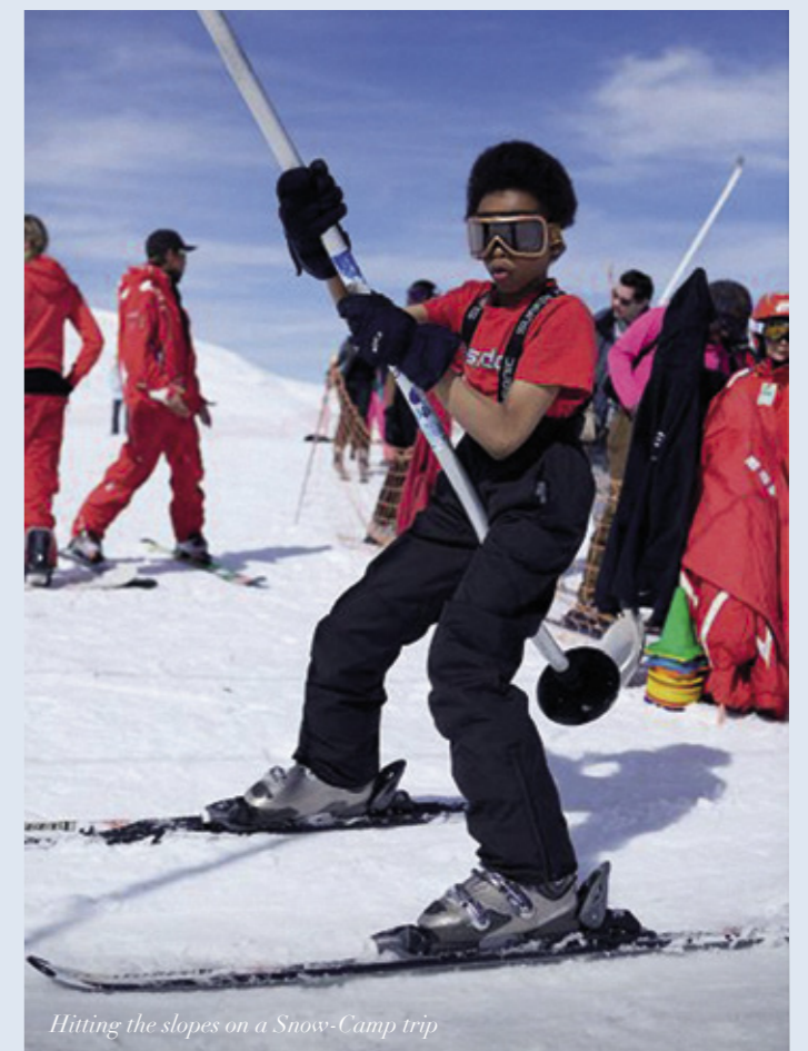
Hitting the slopes on a Snow-Camp trip