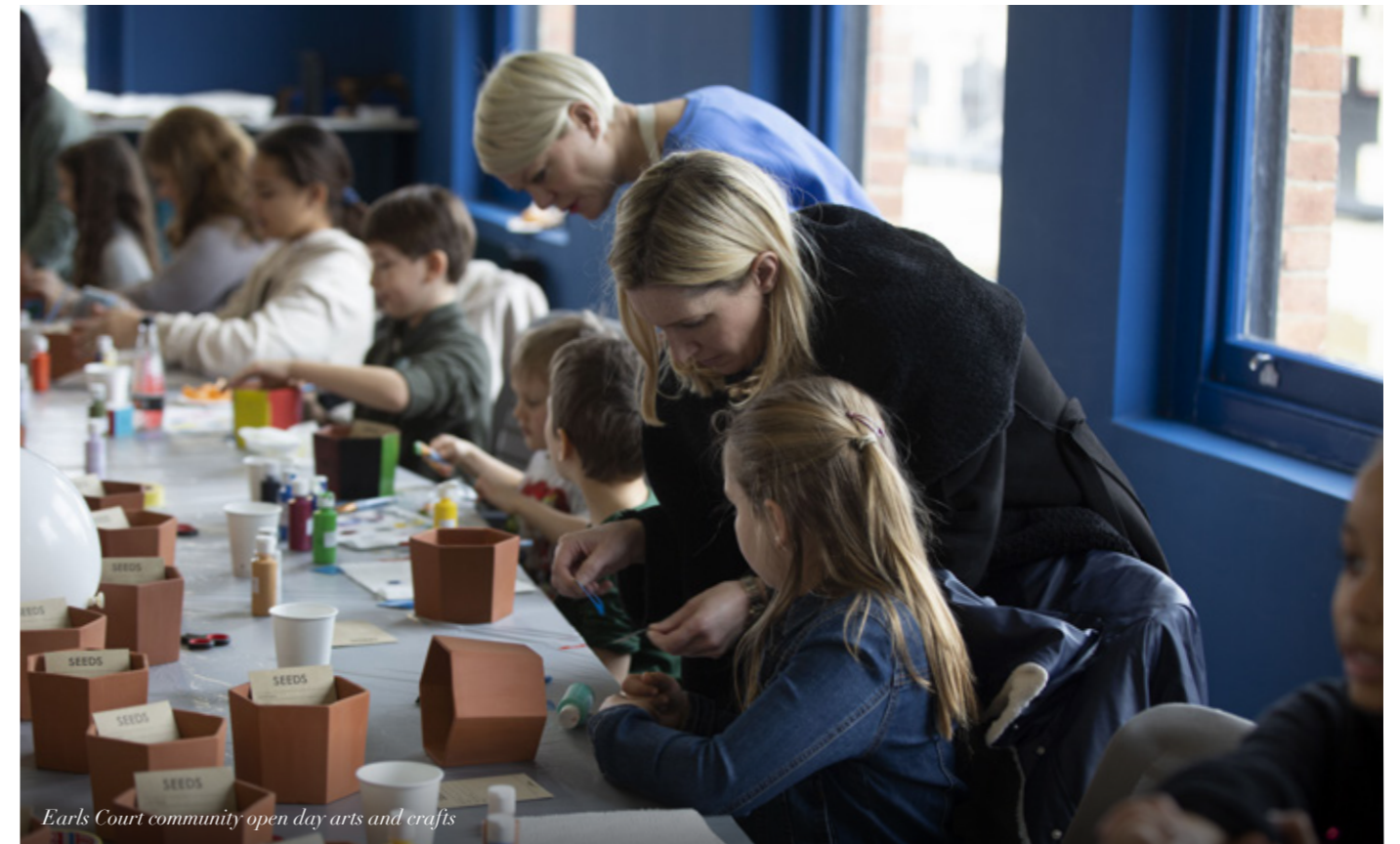
Earls Court community open day arts and crafts