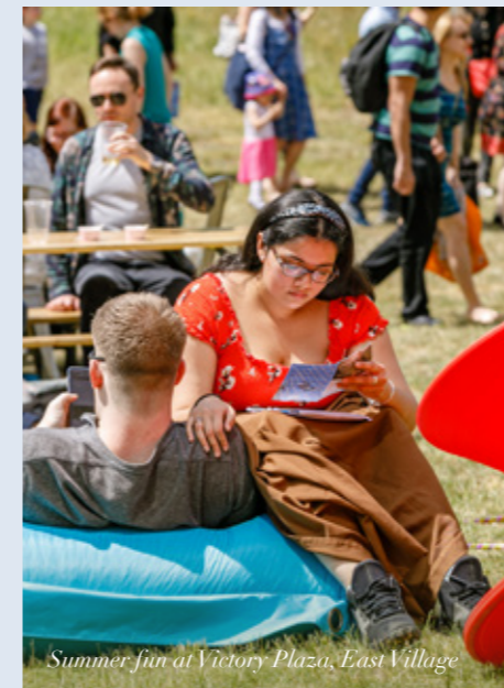
Summer fun at Victory Plaza, East Village

The management team being co-located within the community and a recognisable face within it.