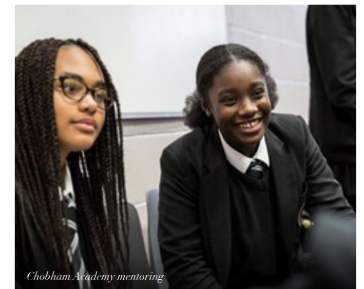
Chobham Academy mentoring