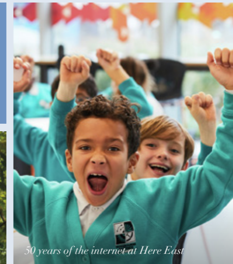
50 years of the internet at Here East

Being innovative in tailoring what we do to the changing needs within the community as the neighbourhood develops over time.