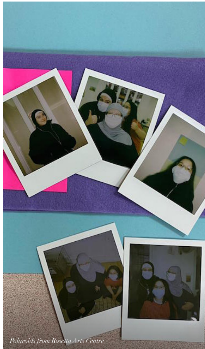
Polaroids from Rosetta Arts Centre

The first year of the programme will end in summer 2021, with an exhibition of works planned in East Village.