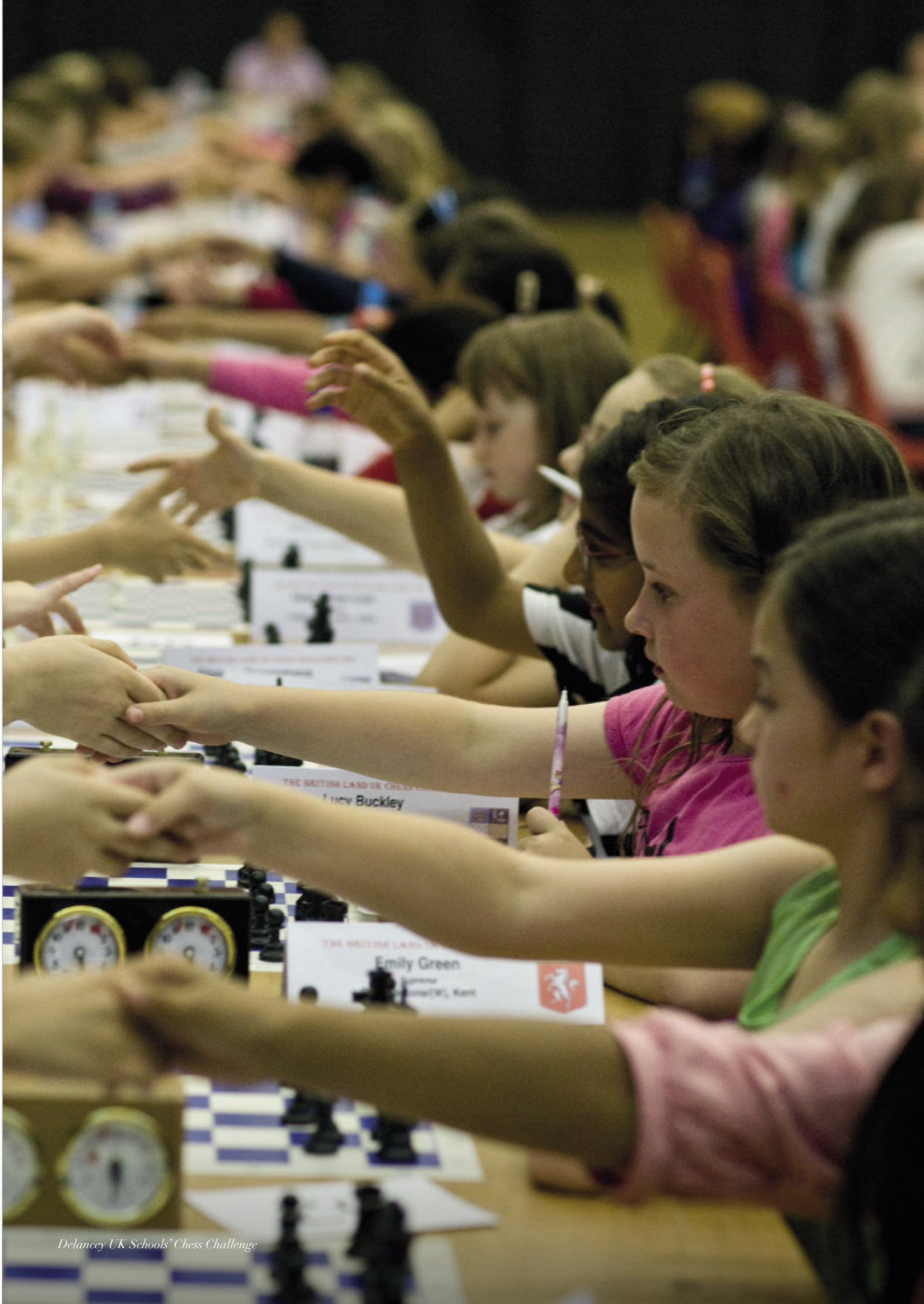
Delancey UK Schools’ Chess Challenge