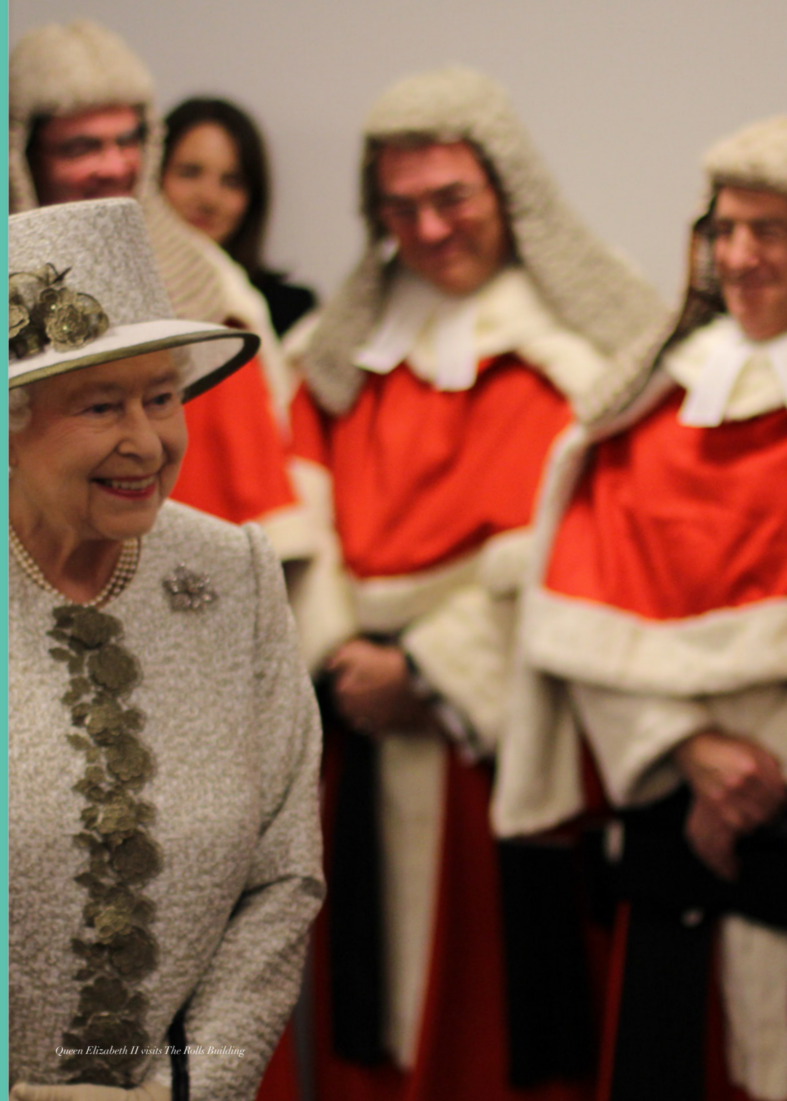
Queen Elizabeth II visits The Rolls Building

SUSTAINABILITY AND GOOD PLACE MAKING ARE AN ESSENTIAL INGREDIENT IN CREATING VALUE