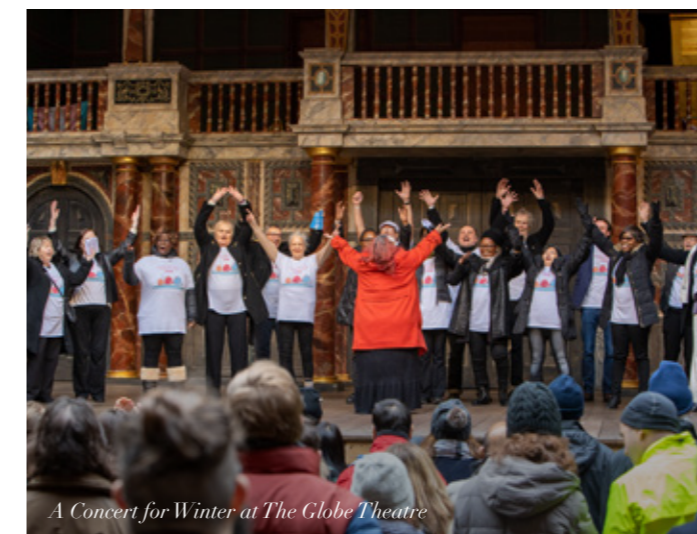
A Concert for Winter at The Globe Theatre