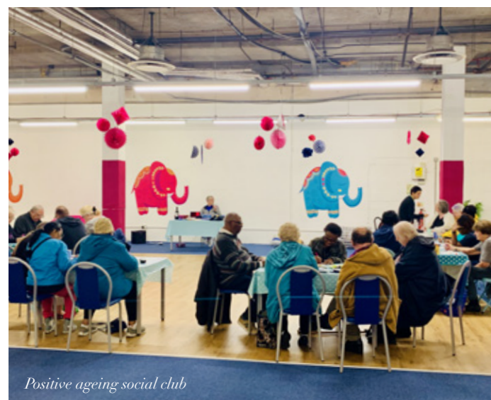
Positive ageing social club