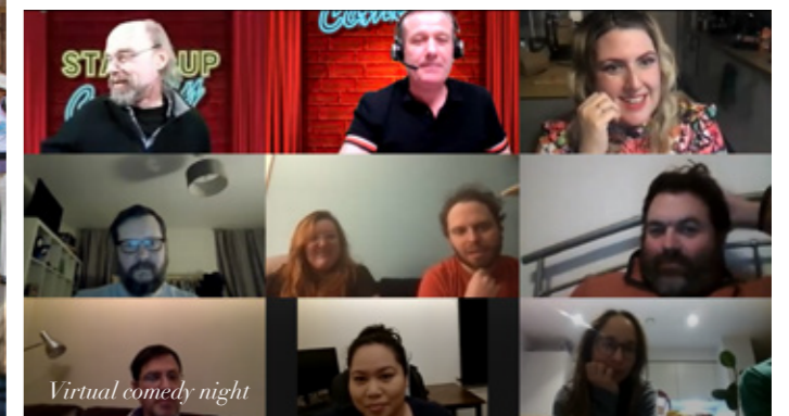
Virtual comedy night