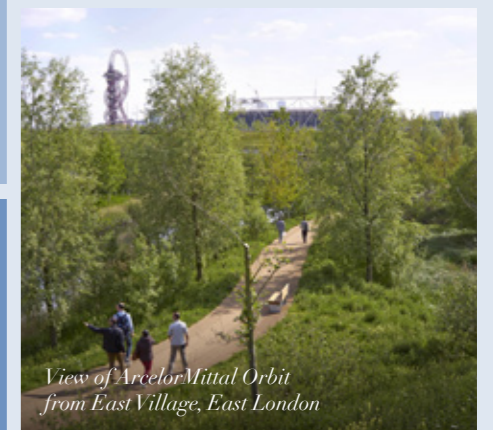
View of ArcelorMittal Orbit from East Village, East London

Overseeing the provision of high quality block and plot building services and estate management.