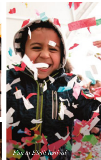
Fun at Elefit festival