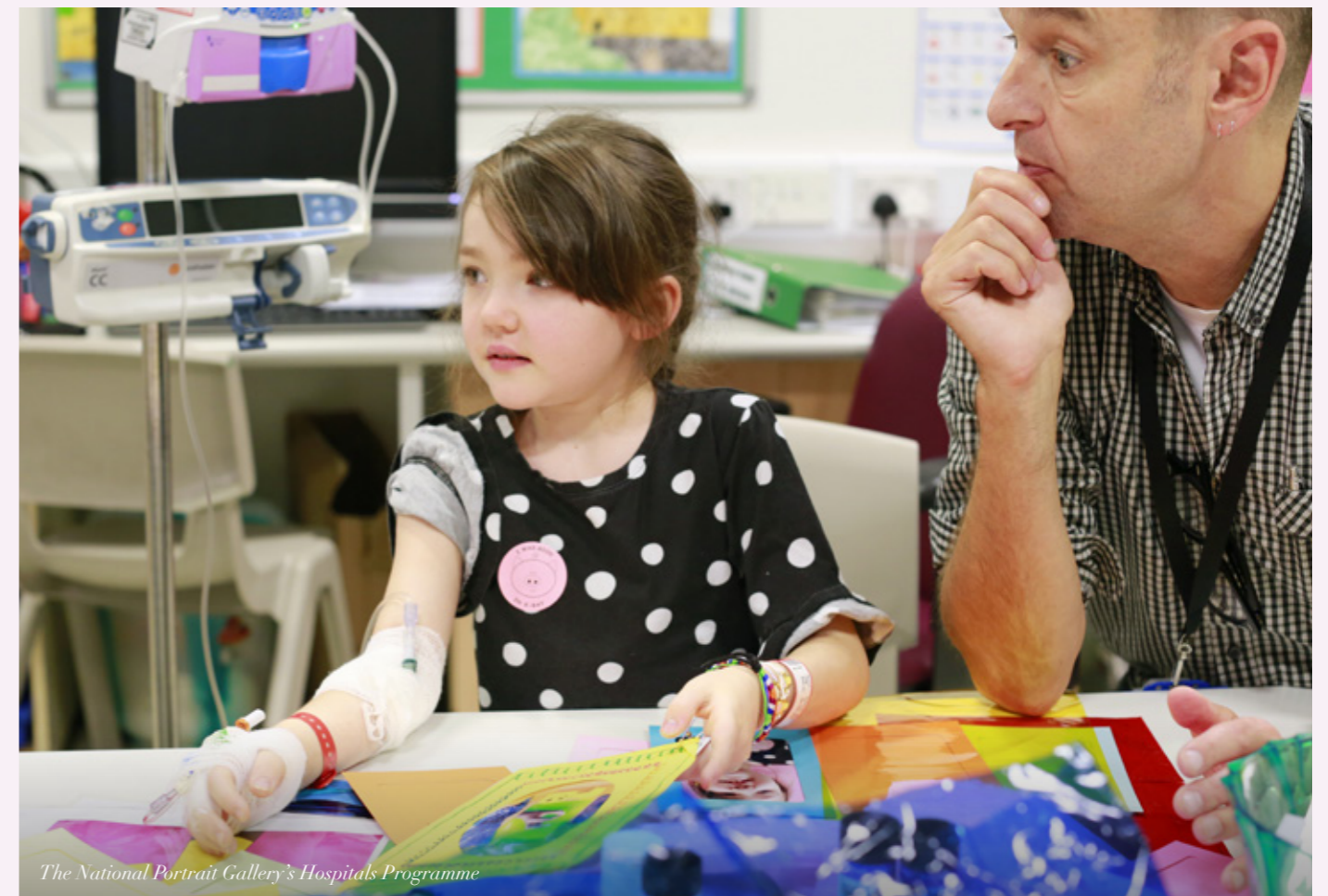
The National Portrait Gallery's Hospitals Programme

The Gallery's programme includes around eighty creative workshops a year, working with photographers, writers and artists, and the scale and quality of the books ensure they can be used in many different clinical settings. The project enables young people and their families to access the Gallery's Collection and helps support health, wellbeing and happiness through participating in the books' activities and workshops.