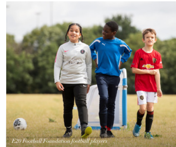
E20 Football Foundation football players

Over the summer holidays they delivered a six-week summer sports programme in accordance with the sport governing body's COVID-19 safe guidance. The team saw how through structured sports sessions, coaching and mentoring, East Village young people developed respect for themselves and others.