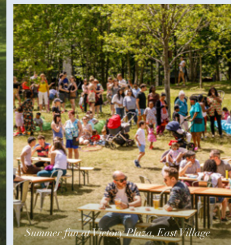
Summer fun at Victory Plaza, East Village

Working with residents to form and sustain a strong and vibrant community.