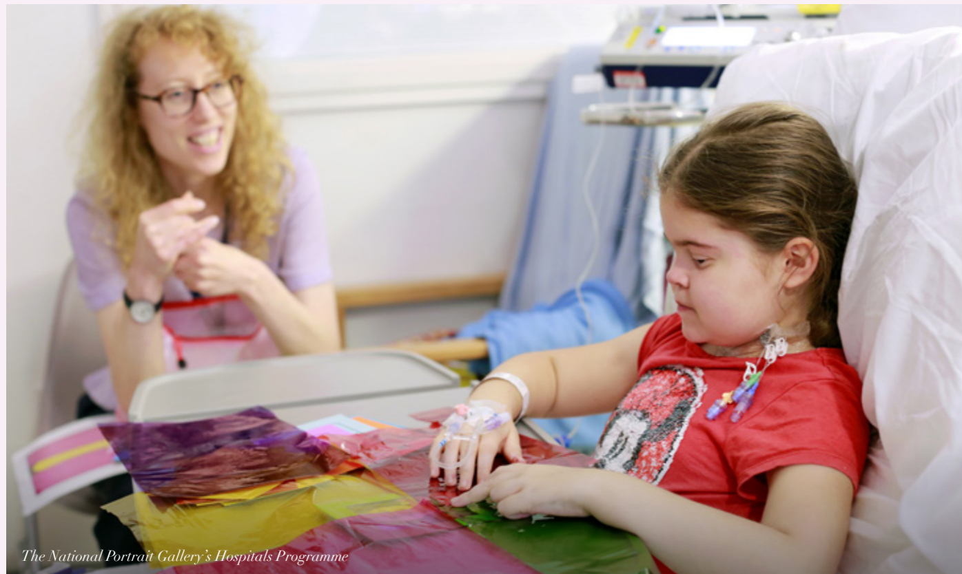
The National Portrait Gallery's Hospitals Programme

"We are thrilled to be able to continue our multi year support for the National Portrait Gallery's Hospitals Programme and be able to extend this to now include the Chelsea and Westminster Hospital until 2024, alongside the four other hospitals in the existing programme. With visiting times terribly limited during COVID-19, projects like this are vital in providing patients and their families with a chance to engage socially and creatively; whilst bringing some positivity to patients' lives and putting a smile on young faces."