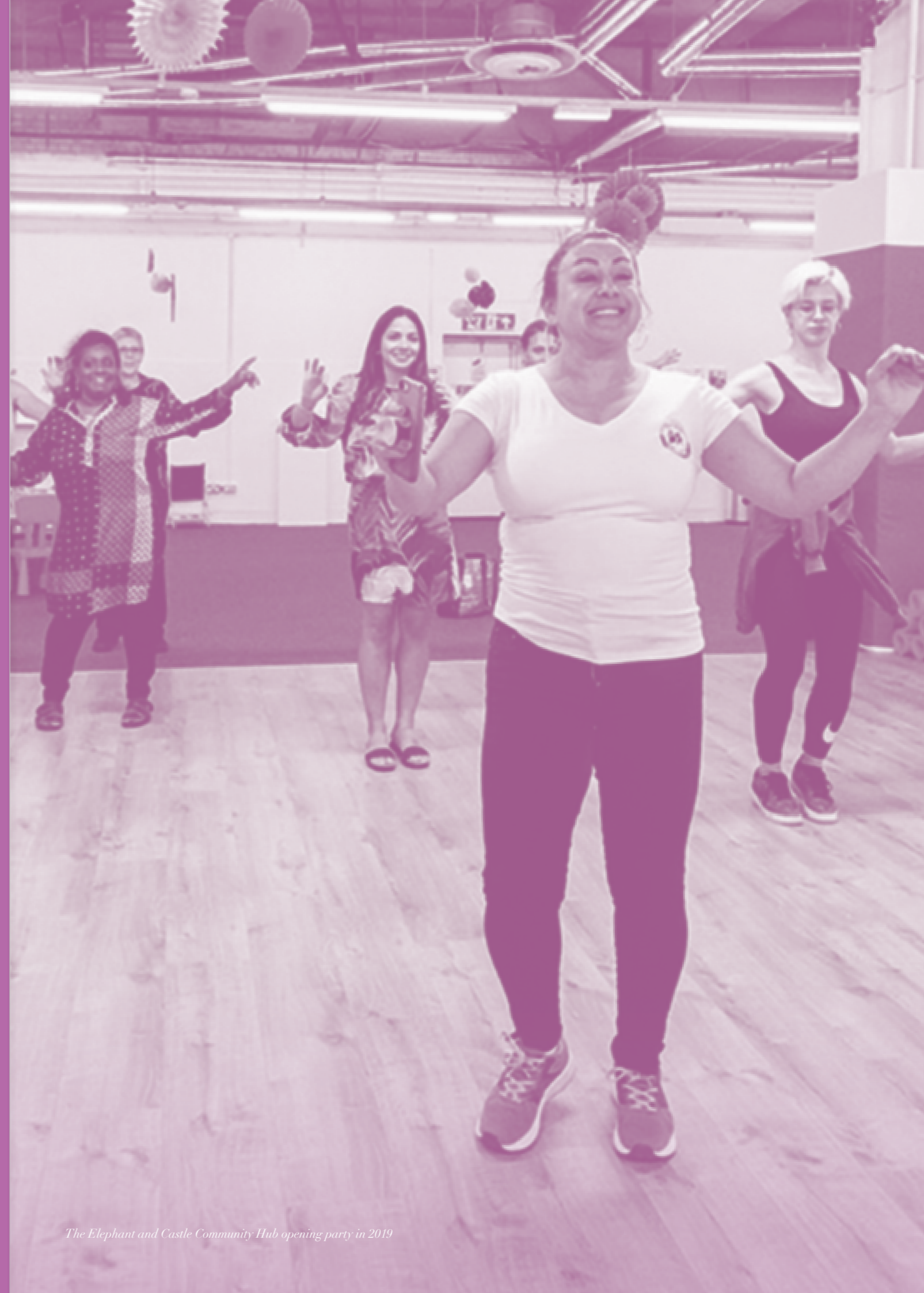
The Elephant and Castle Community Hub opening party in 2019