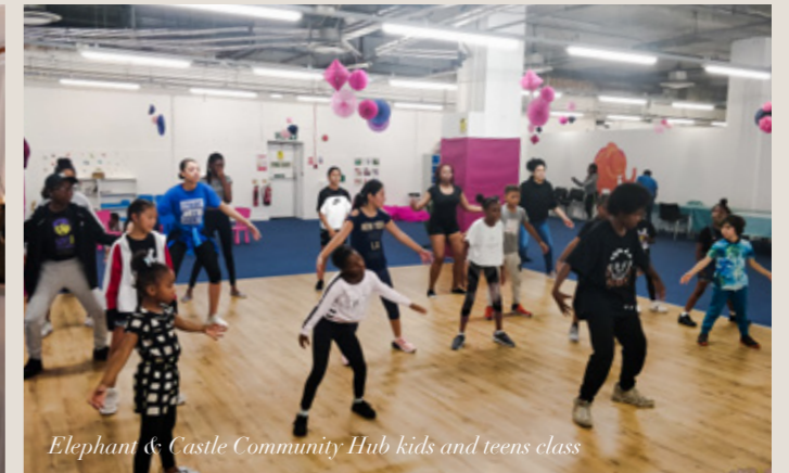
Elephant & Castle Community Hub kids and teens class