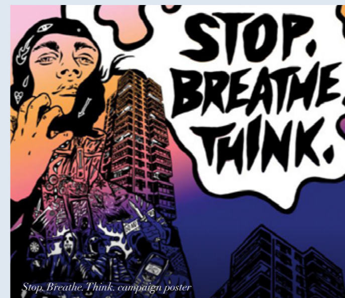
Stop. Breathe. Think. campaign poster

We are very grateful for all these relationships and for the belief Delancey has in our charity, and for all the wonderful support over the years. Thank you from everyone at Snow-Camp."