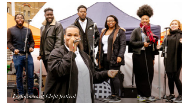
Performers at Elefit festival