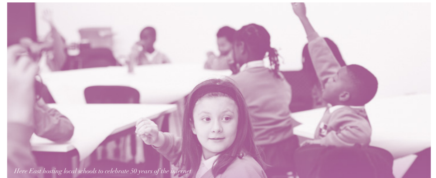
Here East hosting local schools to celebrate 50 years of the internet