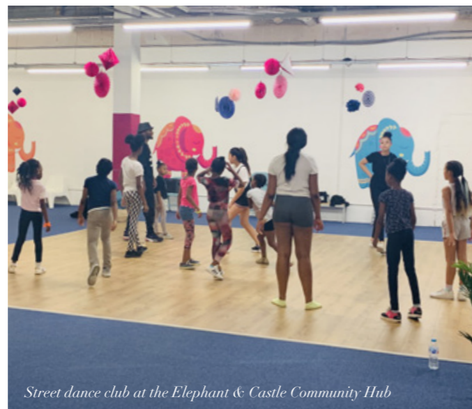
Street dance club at the Elephant & Castle Community Hub