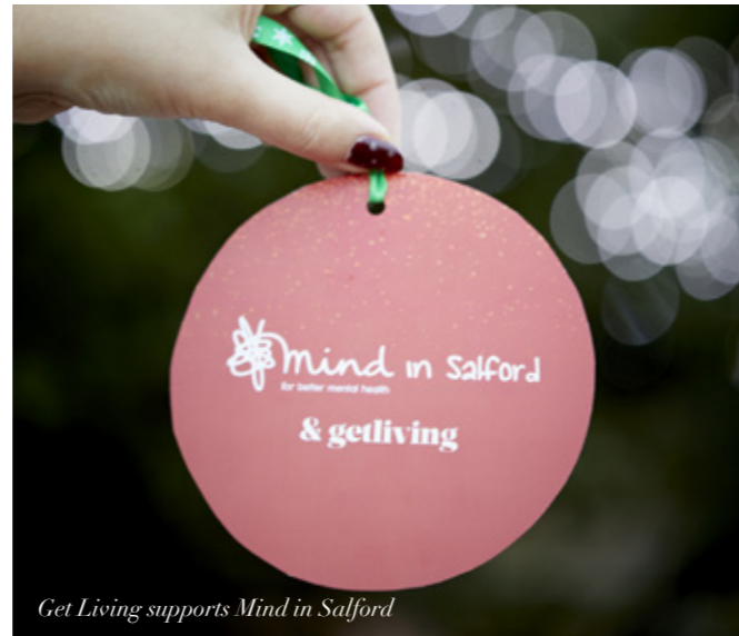
Get Living supports Mind in Salford