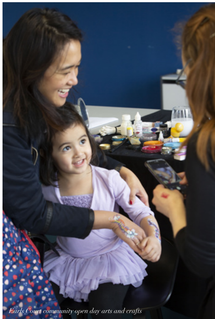
Earls Court community open day arts and crafts