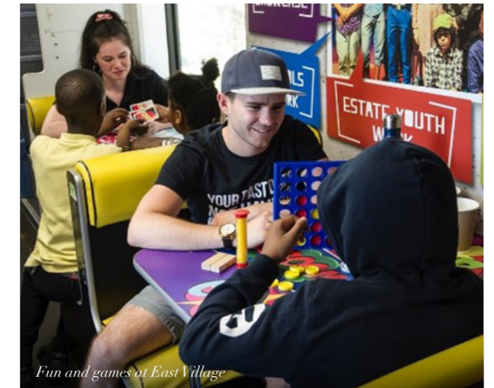
Fun and games at East Village

The team has seen how a positive relationship can restore a young person's trust in people. The team is now planning to develop the mentoring program with further support from XLP and the E20 Football Foundation.