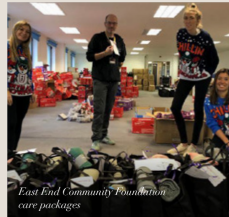
East End Community Foundation care packages

Delancey has always valued and been aware of a building's surroundings and whether directly or indirectly sought to be involved beyond the doorstep.