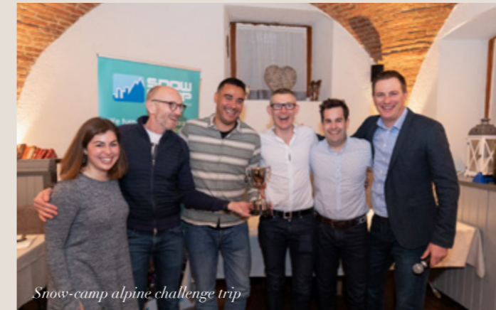
Snow-camp alpine challenge trip