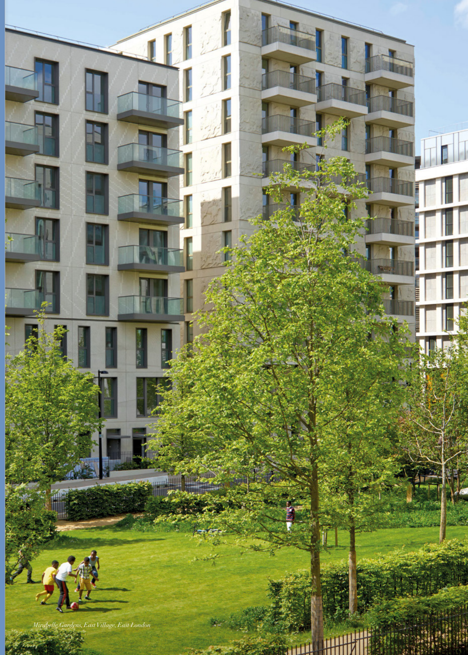
Mirabelle Gardens, East Village, East London

NEIGHBOURHOODS ANCHORED IN THEIR LOCALITY AND SENSITIVE TO THE LOCAL ENVIRONMENT ARE MORE VIBRANT PLACES TO LIVE