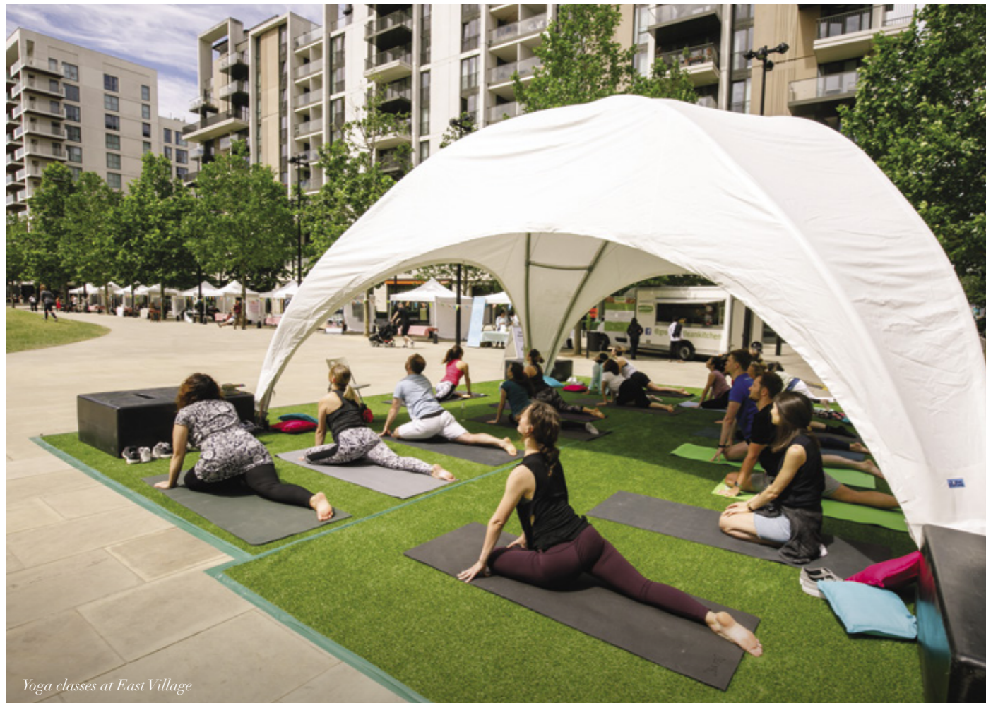
Yoga classes at East Village

This commitment means Get Living creates strong partnerships with impactful local organisations. Since its launch in 2013, it is estimated that Get Living has given more than £500,000 of support to charitable and community causes.